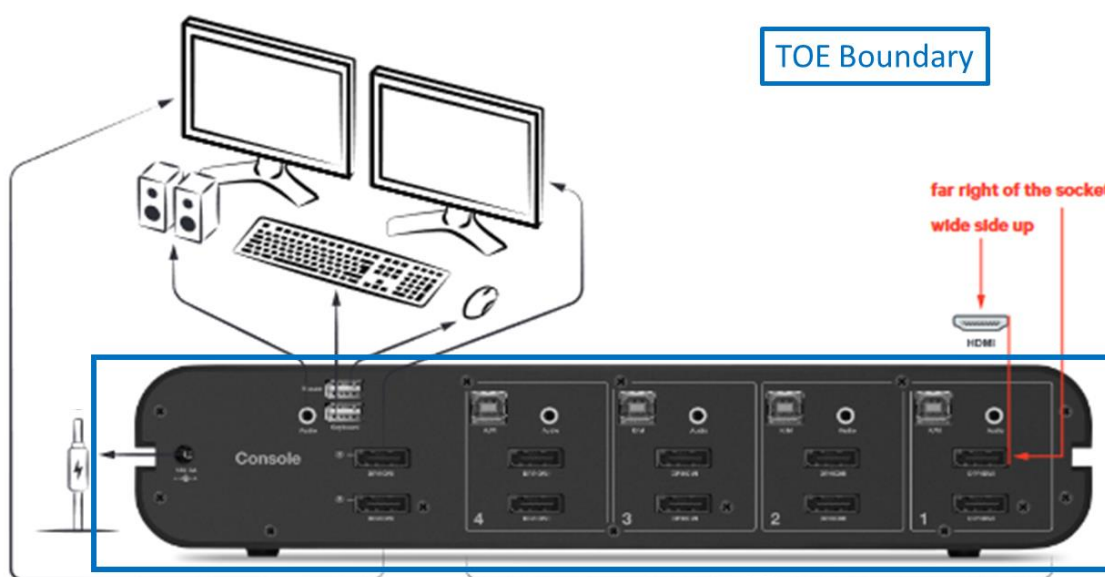
Figure 1: TOE Architecture