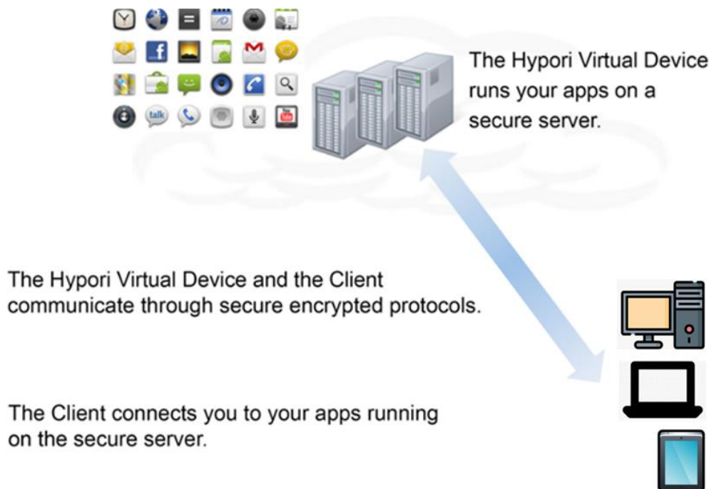
Figure 1 Hypori Halo Client Communication with a Hypori Virtual Device on a Hypori Server

The TOE comprises the Hypori Halo Client (Windows) 4.3 application that installs on the end user's device and communicates with the Hypori Virtual Device on the server using TLS 1.2 (provided by the underlying Windows platform). The Hypori Server, Hypori Virtual Device, Admin Console, User Management Console, applications running on the Hypori Server, the hardware platform device, and any functions not specified in the ST are outside the scope of the TOE. Figure 2 shows the relationship of the TOE to its operational environment.