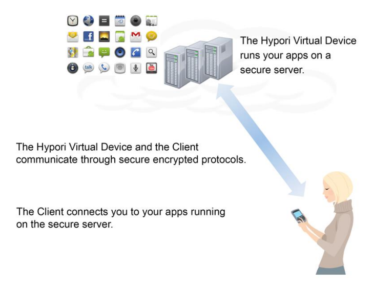
Figure 1 iOS Hypori Client as Part of VMI Platform

The TOE is the Hypori Client. Figure 2 shows how the TOE interacts with a Hypori Virtual Device running applications on a Hypori Server. The Hypori Client is a thin client that communicates only with a Hypori Device on a Hypori Server and not with other servers or applications.