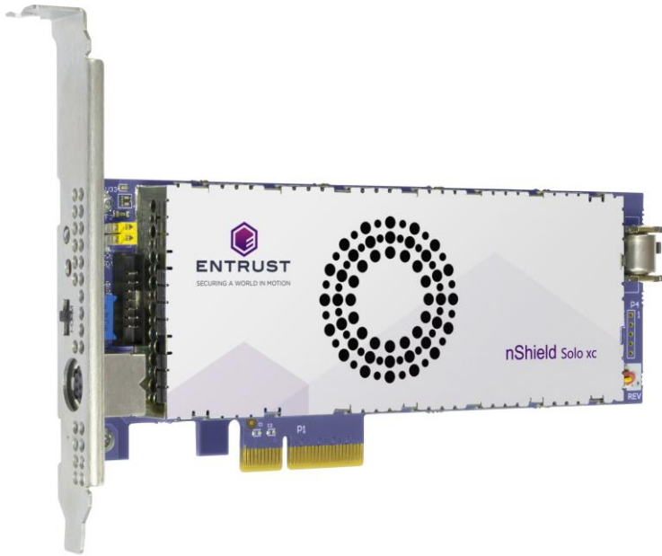
Figure 1 nShield XC HSM