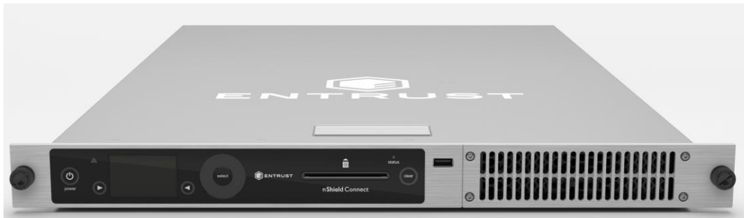
Figure 2 nShield Connect XC