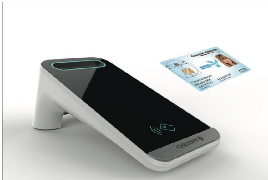
FIGURE 1.1: TOE

The Target of Evaluation (TOE) described in this Security Target is a smart card terminal which fulfils the requirements to be used with the German electronic Health Card (eHC) and the German Health Professional Card (HPC) based on the regulations of the German healthcare system. Please refer to see [gemSpec_KT] for further information about card compatibility. This terminal is based on the specification for a “Secure Interoperable Chip-Card terminal” ([SICCT]) extended and limited by the specifications for the e-Health terminal itself (see [gemSpec_KT]).