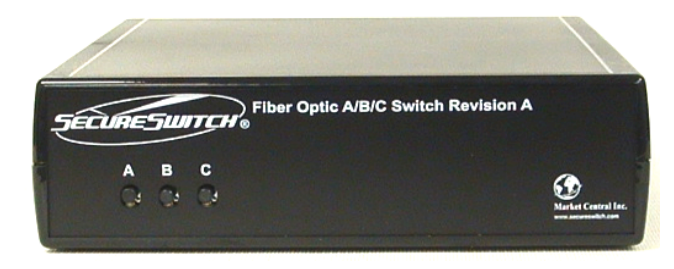
Figure 2: Front Panel SecureSwitch® Revision A

Figure 2 and Figure 3 show the TOE (Revision A) front and back panels. The radio buttons with integrated LEDs on the front indicate the selected network. The A/B/C ports on the back connect to the isolated networks and the Common port connects to the host.