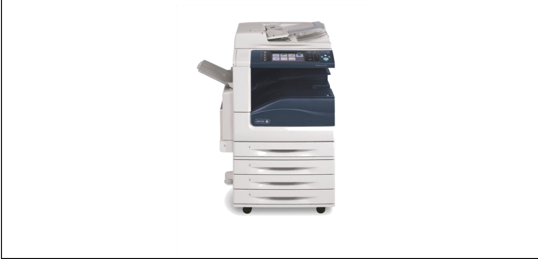
Figure 1: Xerox WorkCentre 7970

The TOE can integrate with an IPv4 network with native support for DHCP. The hardware included in the TOE is shown in the following figures.