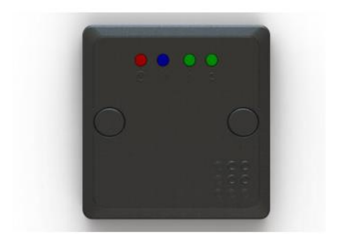
Figure 1 - Lockswitch Bluetooth Controller