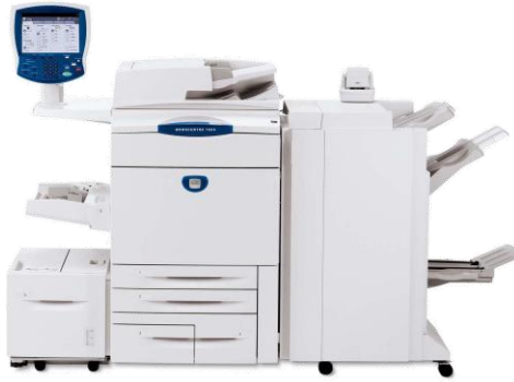
Figure 2: Xerox WorkCentre™ 7755/7765/7775

The various software and firmware that comprise the TOE are listed in Table 2. A system administrator can ensure that they have a TOE by printing a configuration sheet and comparing the version numbers reported on the sheet to the table below.