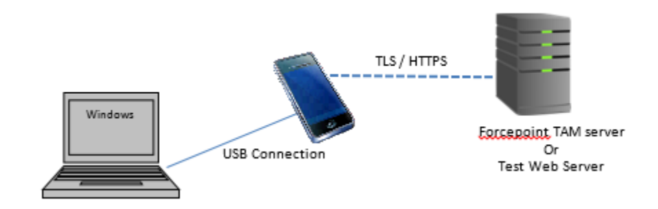
Figure 1: Forcepoint TAM Client TOE Test Environment Setup

The following depicts a diagram of the test environment used by the evaluators: