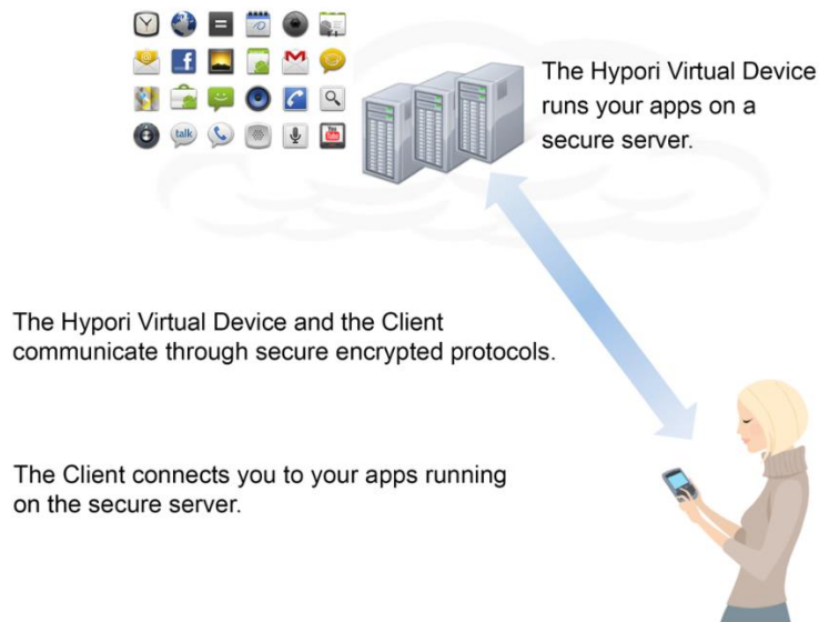
Figure 1 Hypori Client as Part of VMI Platform

The TOE comprises the Hypori Client (Windows) 4.2.0 application as defined in the Hypori Client installation package. The TOE is a Windows-based thin client that communicates only with the Hypori Server, using TLS 1.2 (provided by the underlying Windows platform). The Hypori Server, applications running on the Hypori Server, and any functions not specified in the ST are outside the scope of the TOE. Figure 2 shows the relationship of the TOE to its operational environment.