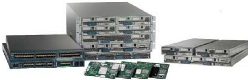
Figure 2: UCS Hardware

The underlying UCS platforms that comprise the TOE have common hardware characteristics. These differing characteristics affect only non-TSF relevant functionality (such as throughput, processing speed, number and type of network connections supported, number of concurrent connections supported, and amount of storage) and therefore support security equivalency of the ASAv in terms of hardware.