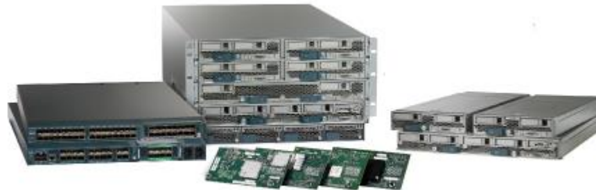
Figure 2: UCS Hardware

The UCS hardware components, which provide the platform for the FMCv, in the TOE have the following distinct characteristics: