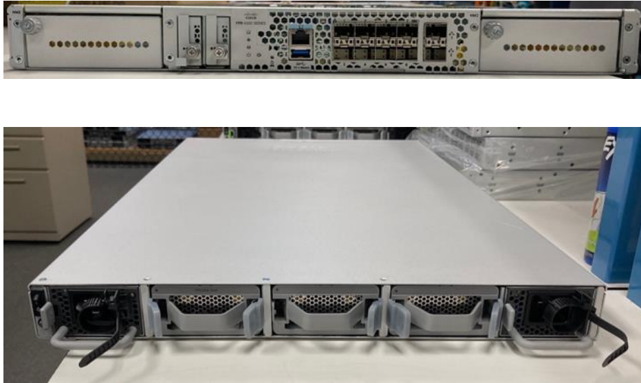
Figure 1: Cisco Secure Firewall 4200 Series Hardware (4215, 4225 and 4245)

The FP4200 models have the following distinct characteristics: